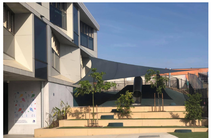
L-block classrooms and shaded play